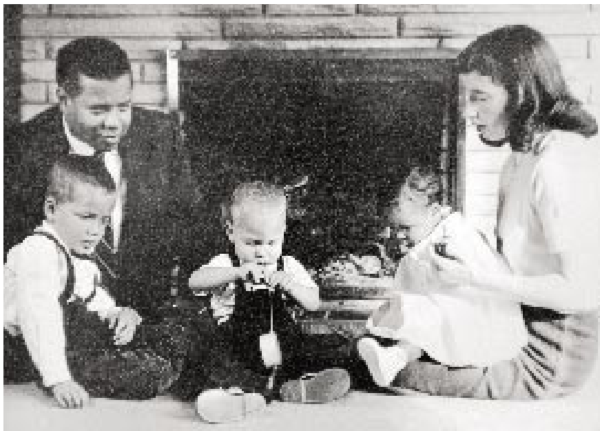
The author (centre), with his family in 1958, grew up in 'a sort of racial limbo'

When I was growing up, I didn't spend much time thinking about who I was or where I fit in. I was too busy tying my shoelaces, brushing my teeth, learning to spell, swinging baseball bats and shooting